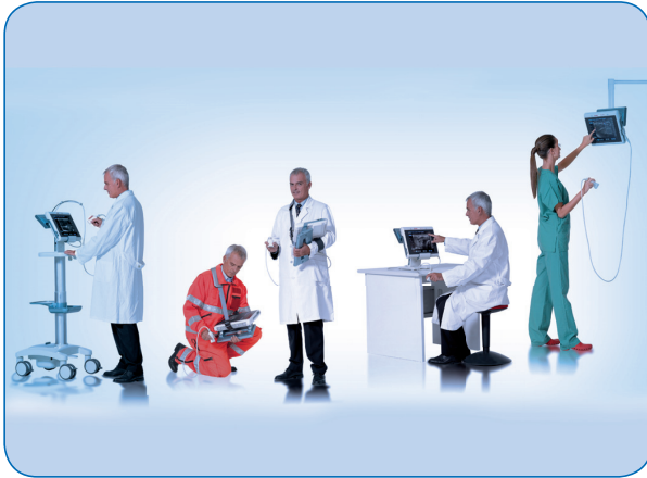
Image1: With four mobility variants, the mobile diagnostic ultrasound system is very flexible