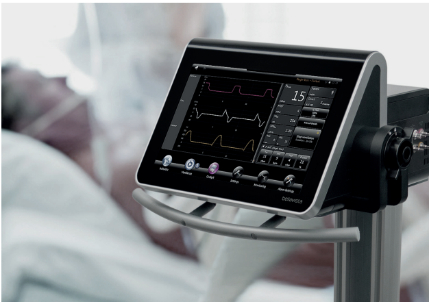
// IMAGE: THE INTEGRATED KONTRON MODULE TAKES OVER THE DISPLAY AND VISUALIZATION OF THE CURRENT VENTILATION PARAMETERS

INTENSIVE CARE VENTILATORS ARE INDISPENSIBLE IN THESE CASES IN ORDER TO SUPPLY THESE PEOPLE WITH OXYGEN FOR A CERTAIN PERIOD OF TIME UNTIL THEY START BREATHING ON THEIR OWN AGAIN. WITH THIS IN MIND, IMTMEDICAL DEVELOPED ITS BELLAVISTA PRODUCT LINE, WHICH WORKS WITH COM EXPRESS MODULES FROM KONTRON.